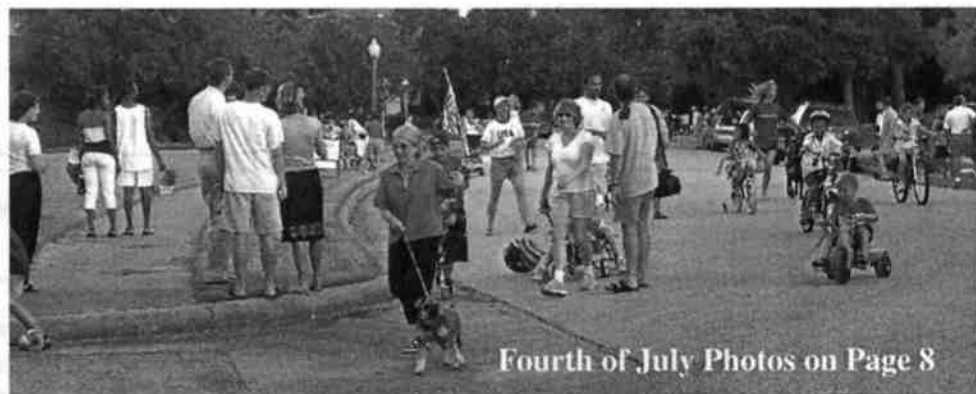
Fourth of July Photos on Page 8