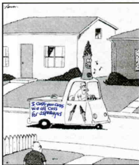
Failed Marketing plays.